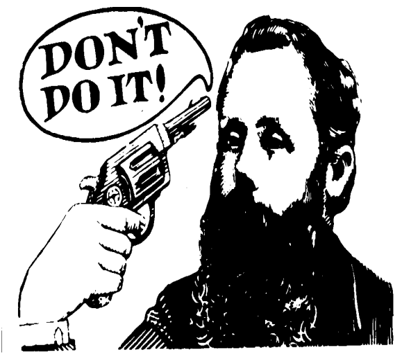
"After all - Alison Freebairn is not the only woman in the world!"

Water the Garden: to change the intravenous bottles that serve as the sole source of nourishment for severely neurologically impaired patients. \aleph